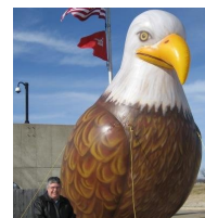
Soaring with Eagles